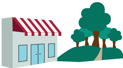
Neighborhood & Community Development