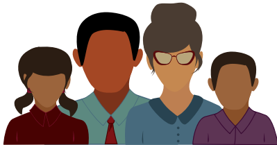
Youth & Family