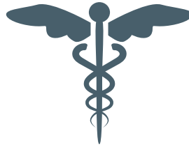
Public Health & Safety